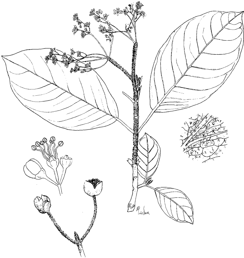
FIG. 1. Hydrangea nebulicola . (Gómez-Pompa 1541). Flowering branch with details of inflorescence and pubescence of lower leaf-surface.

success to search for pistillate specimens. All that we have observed is that the flowering of the species is rare although it may continue over several months. With these considerations in mind and the realization that the species is both rare and dioecious we can understand the importance of vegetative reproduction and its rôle in survival.