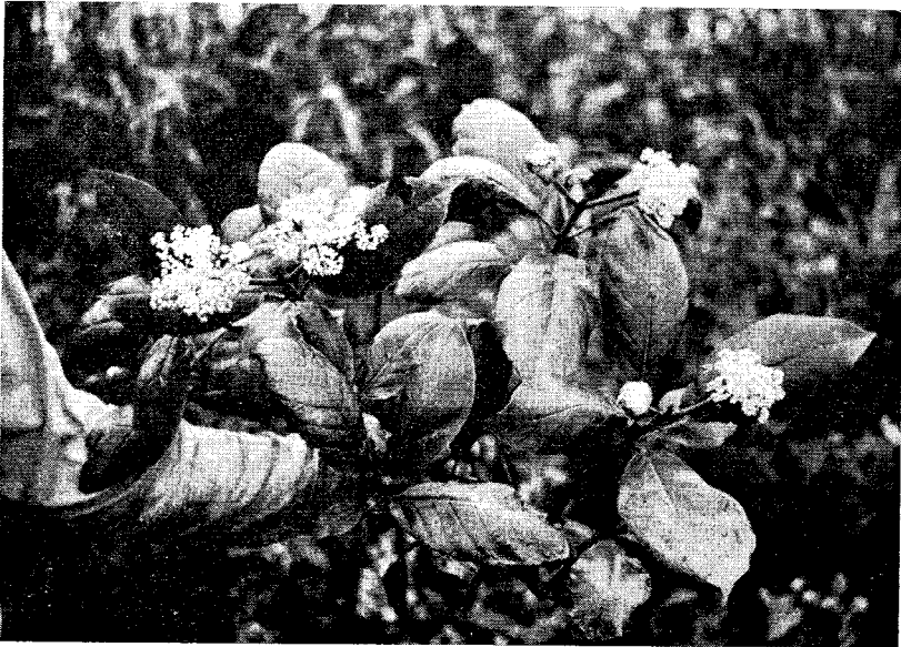
FIG. 2. Flowering branch of Hydrangea nebucicola showing paired inflorescences at anthesis and young inflorescences enclosed by cucullate bracts. Photograph from Nevling & Gómez-Pompa 39 .

semblance to juvenile shoots was found. These, termed runner-shoots, were discovered along the forest floor, sometimes covered by leaf-litter. They permit a single plant to climb several individual trees simultaneously. Runner-shoots (FIG. 3) were quite common and are characterized morphologically by reduced bract-like deciduous leaves and adventitious roots on the lower and lateral surfaces, similar in external appearance to those found in Hedera helix L. These peculiar shoots seem to be selective as to the substrate tree, for they were found ascending only relatively mature tree trunks, although no selection as to substrate species is obvious. As a runner-shoot begins an ascent the reduced leaves become larger with a few marginal serrations above the middle of the lamina but very soon become similar to the mature leaf in form and size. The climbing shoot (FIG. 3) is characterized by a very marked unequal production of secondary xylem, the mass of the new wood being produced in the direction of the substrate. This apparently permits the continuing production of the adventitious roots necessary for attachment to the substrate. It is believed that detailed comparison of the wood anatomy of climbing vs. non-climbing species of Hydrangea might prove useful in the determination of evolutionary direction within the genus.